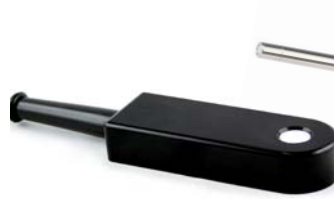
FLT - perfect for the PLC connection and monitoring