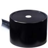
Radiometric sensors - universal use

the maximum overall height is limited or for high temperatures. These sensors can be connected to the RMD & RMD Pro: