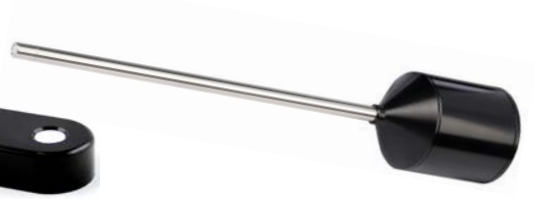
UV probes - for bad accessible areas