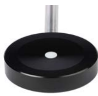
XT sensors - for high irradiances and temperatures